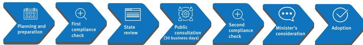
Diagram: Overview of the pathways available under the new MGR for making or amending an LGIP